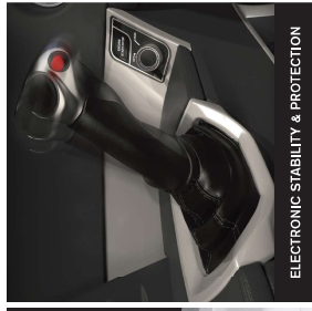
ELECTRONIC STABILITY & PROTECTION