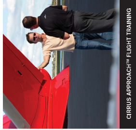
CIRRUS APPROACH™ FLIGHT TRAINING