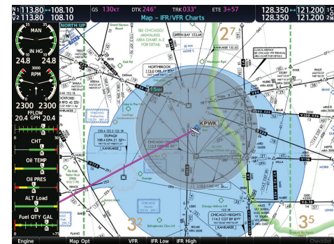
IFR High and Low Charts