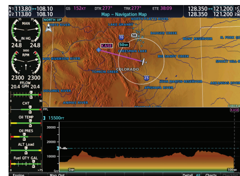
Vertical Situation Display